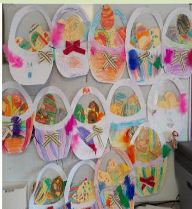
We so enjoyed decorating our Easter Eggs and Easter Baskets. Who needs google images to get ideas? All of these creations came from our own imagination.