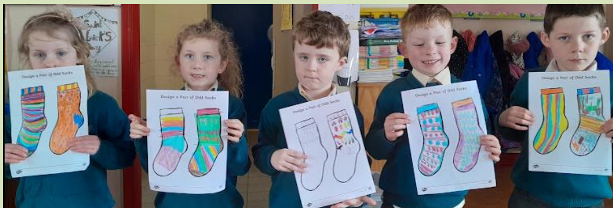
A sample of our Infant Odd Socks decorated.