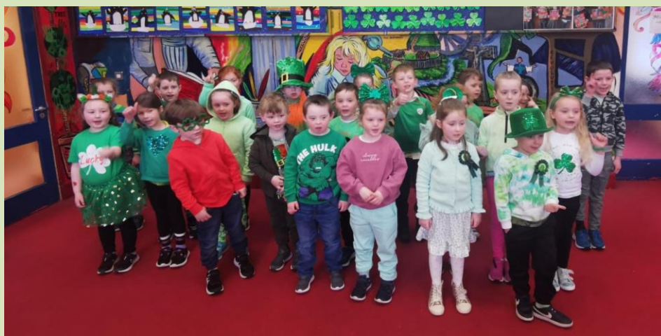
We also showed off our talents as did the other classes during our Green Day Concert.