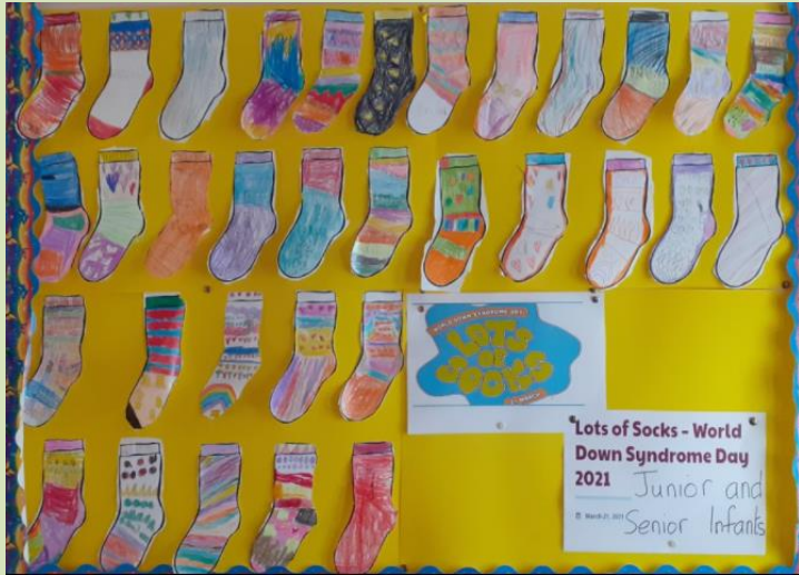
Lots of Socks - World Down Syndrome Day Artwork