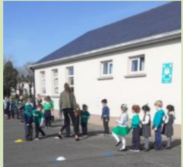
St. Patrick's Day Treasure Hunt