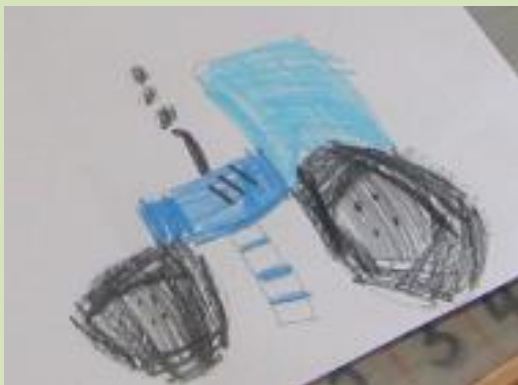
A safe tractor for farm safety