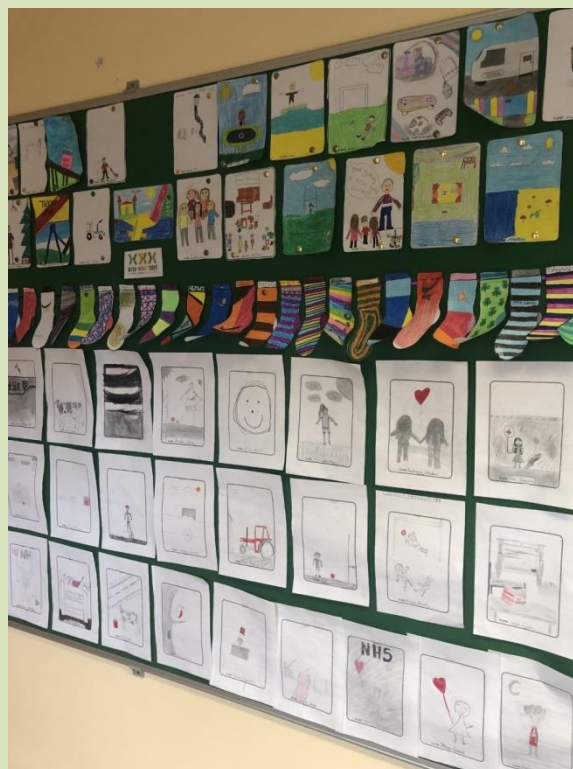
Some 5 th & 6 th class art work