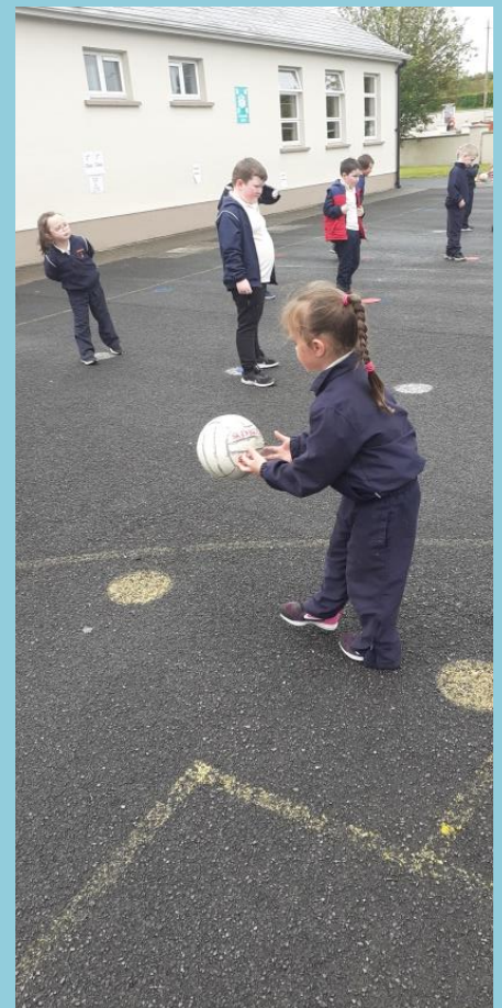
Things are looking good for the future of Cavan Ladies and men's football.