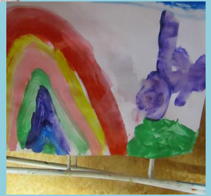
Our summer painting. How creative we are!!