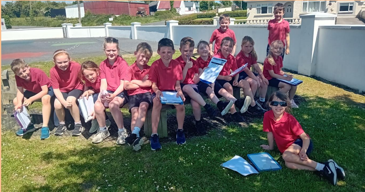
Taking a break from the sun!